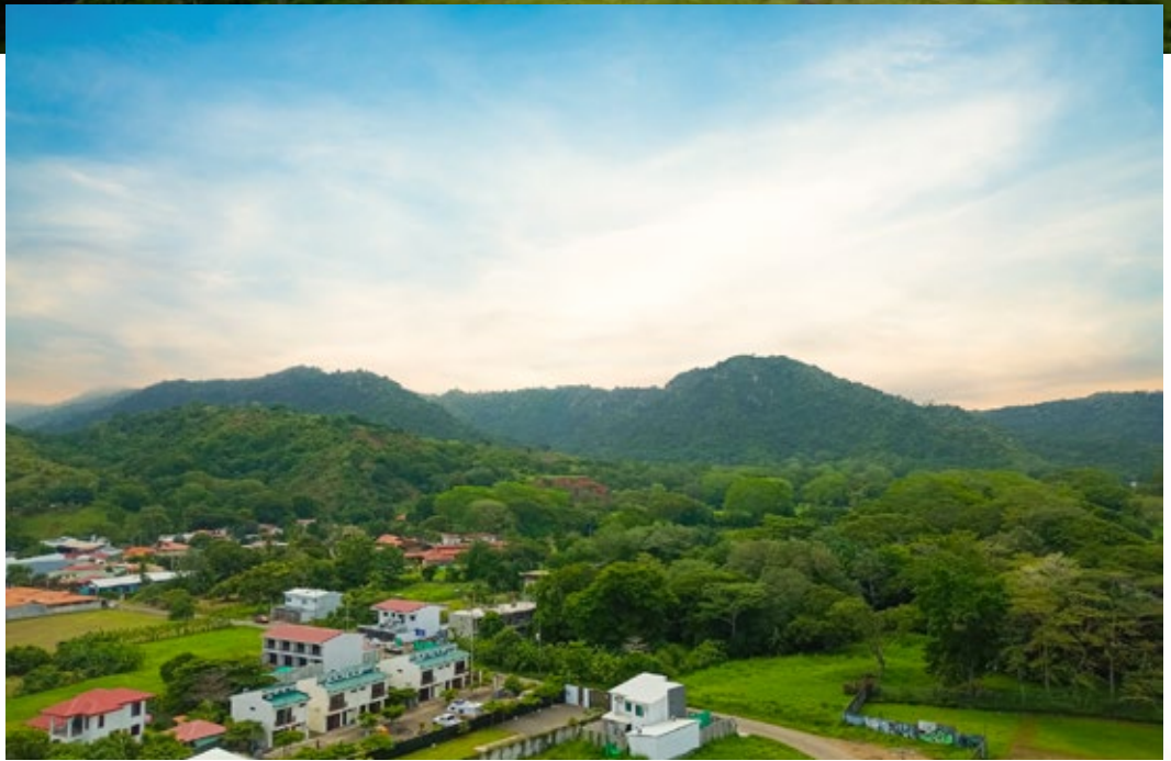
MOUNTAIN VIEW PENTHOUSE