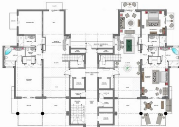
13 TH FLOOR - 2 ND STORY OF THE PENTHOUSE