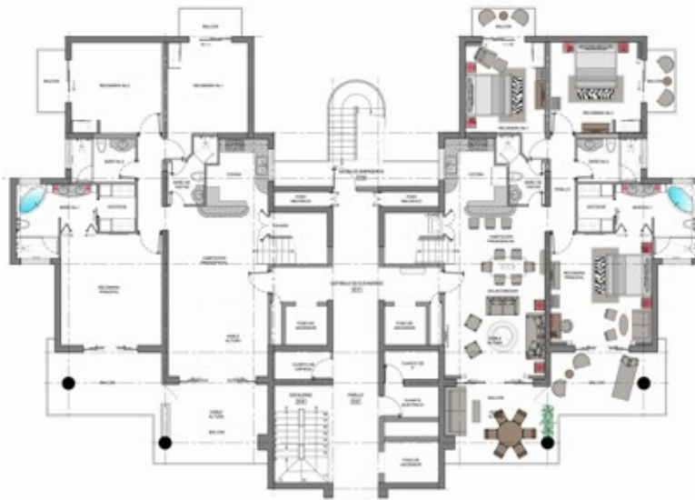
12 TH FLOOR - 1 ST STORY OF THE PENTHOUSE

The Penthouses have a breathtaking internal atrium space connecting the main floor and second floor bedrooms. Also featured is private VIP elevator access directly inside the condo with card security in the main lobby. The oversized master suite is perfectly positioned to enjoy the panoramic ocean views from its balcony. It features a huge walk-in closet and a gorgeous custom-designed bathroom. The second spacious master bedroom offers its own private bathroom and balcony with gorgeous views to the ocean and city centre. The remaining guest bedrooms also feature stunning views and full amenities.