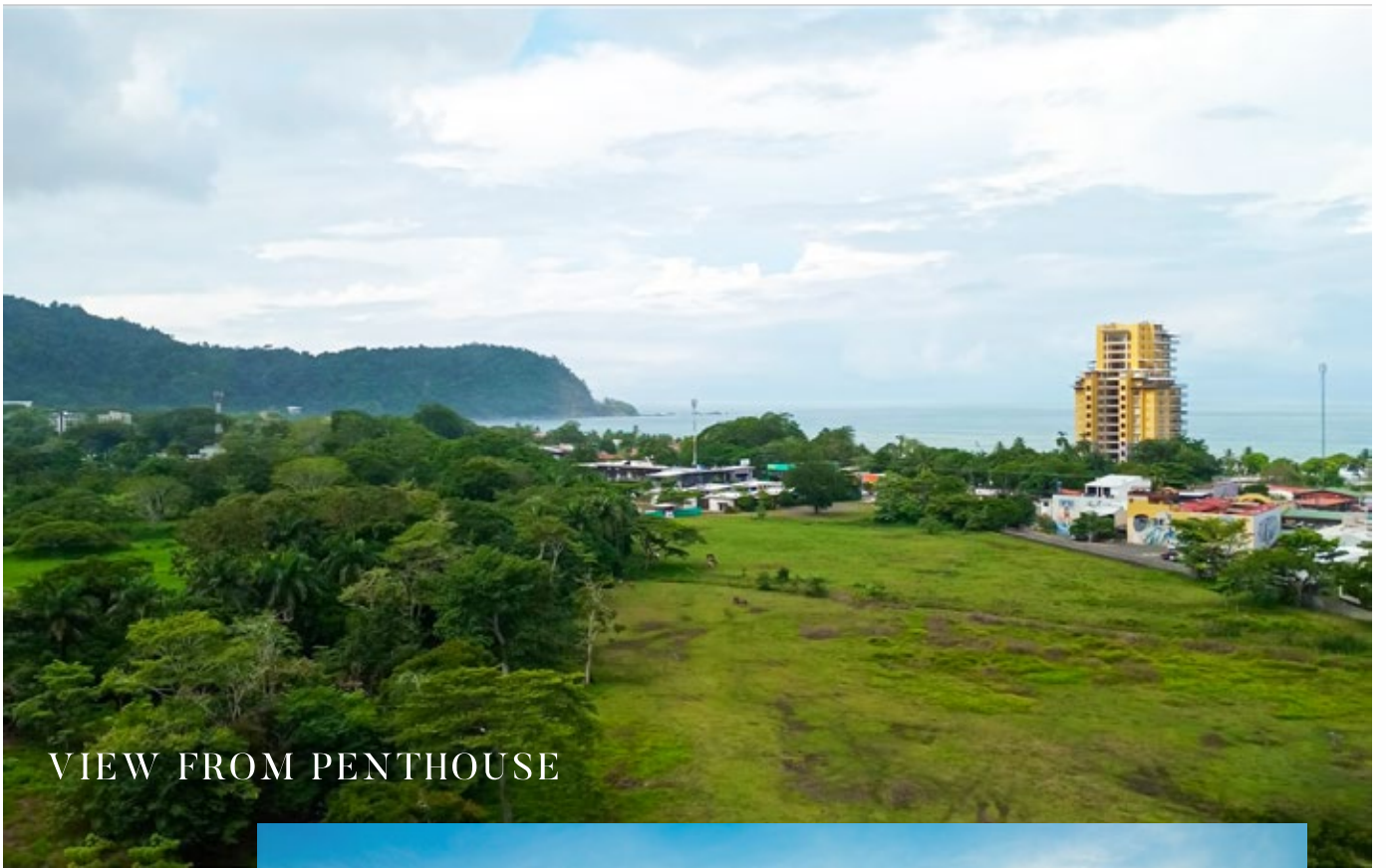
VIEW FROM PENTHOUSE